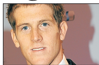
Nick Dal Santo

to his teammates for the scandal he has inadvertently dropped them in.