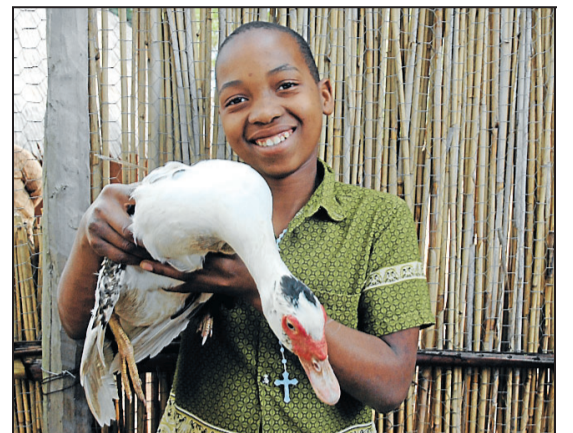
Feeling clucky... Oxfam is offering ducks, pigs and poo as gifts to help people in developing countries.